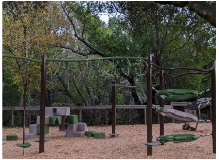
Playground adjacent to picnic areas