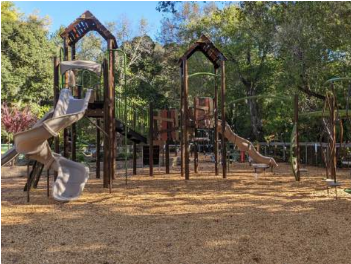
Playground adjacent to picnic areas