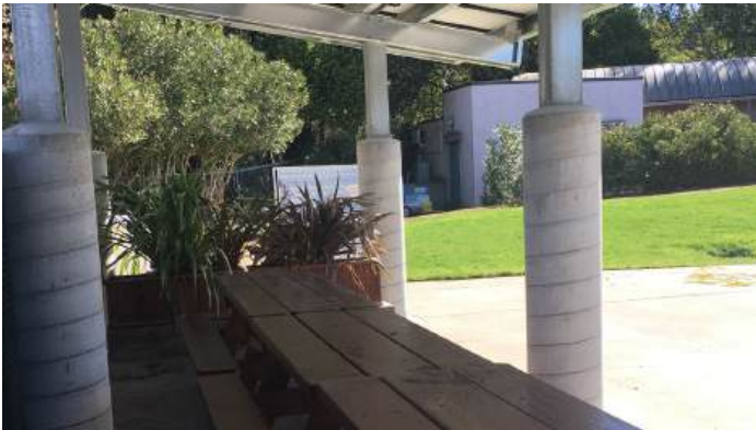
Patio Party area