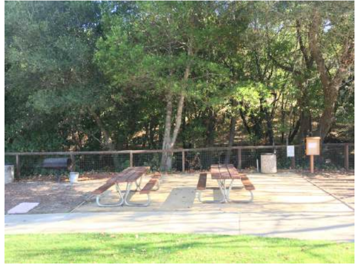
Parkside Picnic Area