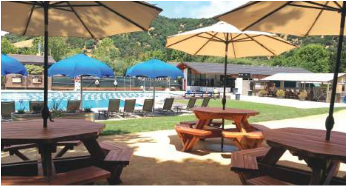
Hillside Party area