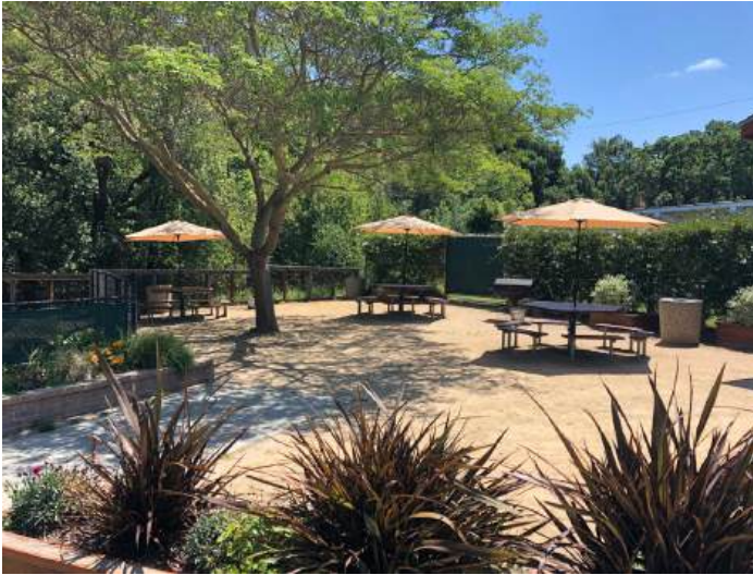
Group Picnic Area