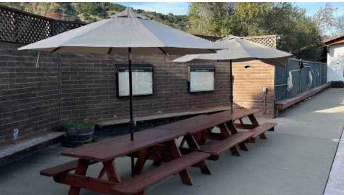
Alcove Party area